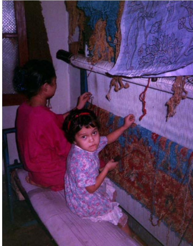
Figure 3: Four-year old Hazara girl and an older sister weaving a carpet at home

The most pressing concern related to GoP policies regarding the carpet industry is their impact on the welfare of refugee children. The most time-consuming and arduous component of carpet making is weaving. The small hands of children, their dexterity, and the speed at which they work compel Hazara families to recruit their own children into the industry. As a result, many children forego primary school to work an average of twelve hours a day to support their families. Children enter the carpet industry as weavers as early as four years old (See Figure 1). At age sixteen, males are encouraged to continue in the industry as dyers or pattern makers, while females of the same age typically manage younger siblings in carpet weaving. It is unclear how the GoP proposes to shed the image of carpet towns as incubators of child labor. A manager of the Chamkani Carpet Town noted that schools would be built inside the carpet towns for children. Nevertheless, it remains difficult to fathom how the time of weavers will be apportioned between carpet making and school. Further research needs to be conducted regarding the fate of Peshawar's carpet towns. This is especially important given the pace of Afghan repatriation.