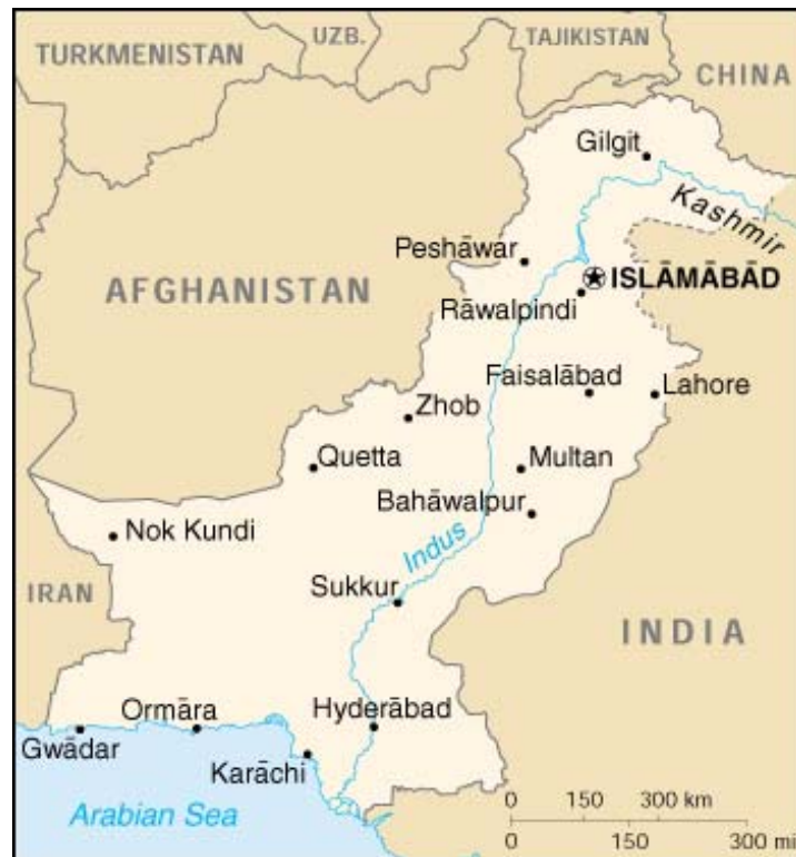
Figure 1: Map of Pakistan 4